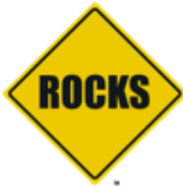
Figure A-1. Rocks® logo

Commercial entities that wish to use any of the above names or logo in a product name or marketing material, are required to get written permission from the Technology Transfer and Intellectual Property Services Office at UCSD <invent@ucsd.edu>.