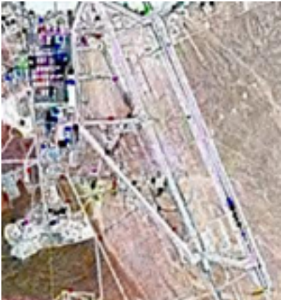
Version 4.2.1 Edition